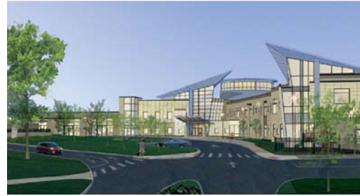
West Bristol K-8 School

Due to the timing of the project to construct the Forestville and West Bristol K-8 Schools it soon became apparent that the City of Bristol was going to be able to complete this initiative, as designed, $18 million under budget. That figure is likely to increase due to the $2.5 million that was deposited in the mandated contingency fund.