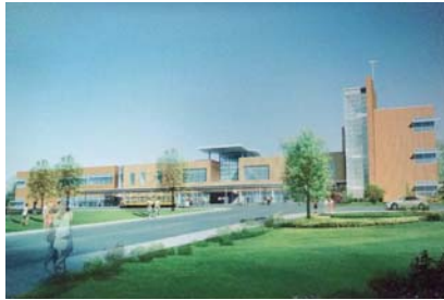
Forestville K-8 School