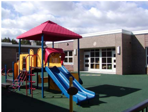
Renovations to Ivy Drive Elementary School