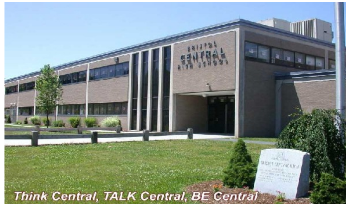
Bristol Central High School on Wolcott Street, Bristol