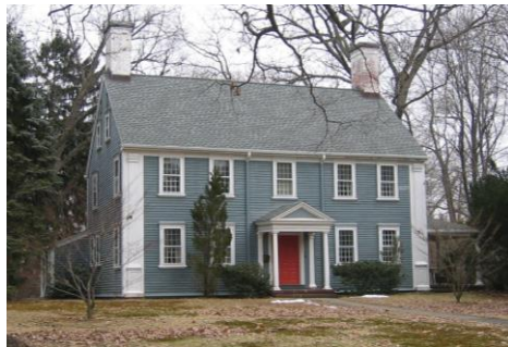
4 Oakland Street

About a week before the meeting, you will receive a copy of the meeting agenda. If your application was filed in a timely manner, it will appear on the agenda under "Public Hearings."