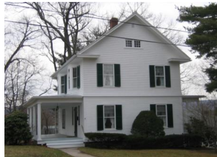
18 Broadview Street

To assist it with carrying out its responsibilities, the Commission has developed and adopted a set of design and materials guidelines that are used to help the Commission decide upon the appropriateness of activities proposed within the District. The guidelines are also intended to help residents of the District understand the Commission's general preferences as it reviews proposed changes.